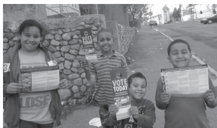
MCAN engages younger generations in the importance of community organizing and voting. These four children of leaders in Brockton helped canvass for the 2014 Earned Sick Time Ballot Initiative in Massachusetts.

MCAN began in 1985 through conversations among religious leaders about social justice and neighborhood issues. Founding Director