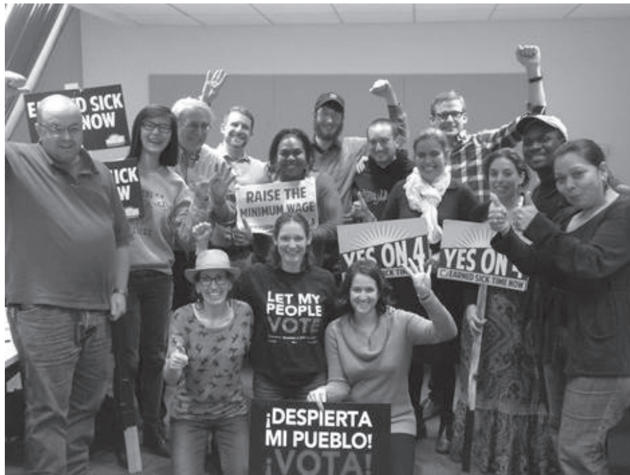
MCAN staff together in their offices in Boston, MA. Here they celebrate after the sick time ballot initiative passed in the legislature.