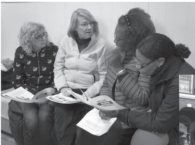
Members of Essex County Community Organization, an affiliate of MCAN in the North Shore of MA, share stories of racial prejudice and discuss how to build their beloved community in Massachusetts.