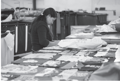
A worker up-cycles used t-shirts into blankets for the Massachusetts-based company Project Repat.

“CCHD found a deep authenticity to our story and took a chance on us. It’s one of the only groups willing to fund community economic development. It