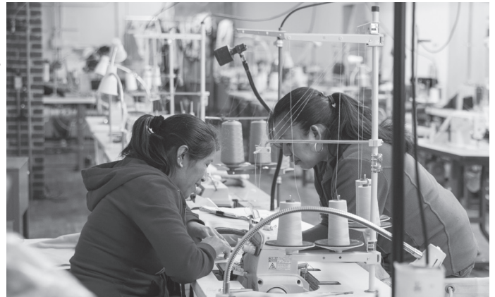
Workers at Opportunity Threads help each other solve a problem at the sewing machine.