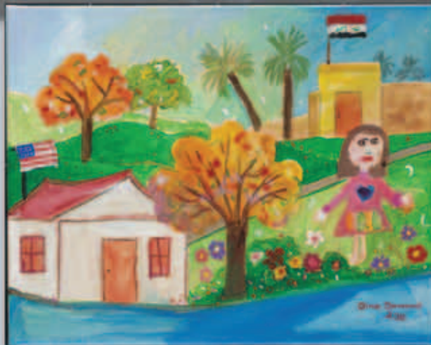
Bawi; 10-13, Burmese refugee: "Old Home, New Home"

In celebration of World Refugee Day, 2010, MRS sponsored a Refugee Youth Poster Contest in which refugee youth resettled by the MRS resettlement network had the opportunity to creatively express what resettlement in the United States has meant to them. Incorporating UNHCR's 2010 theme of a refugee's home, MRS invited youth ages 5-18 to submit posters and descriptions of their new homes.