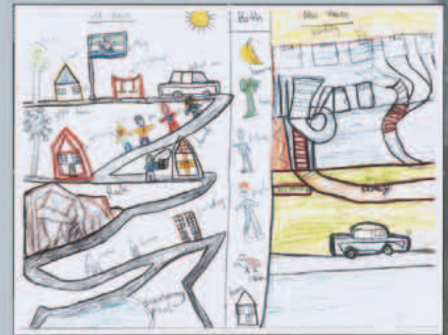
Dina; 5-9, Iraqi refugee: "From Iraq to the U.S."

Following the lead of Pope Benedict XVI, who focused on migrant children in his 2010 World Day of Migrants and Refugees message, the bishops decided to use this as a second theme in 2010. Children are an exceptionally vulnerable population that are easily taken advantage of, exploited and abused. This is particularly true when they are undocumented and unaccompanied in a foreign country and, all too often, with nobody to turn to for help.