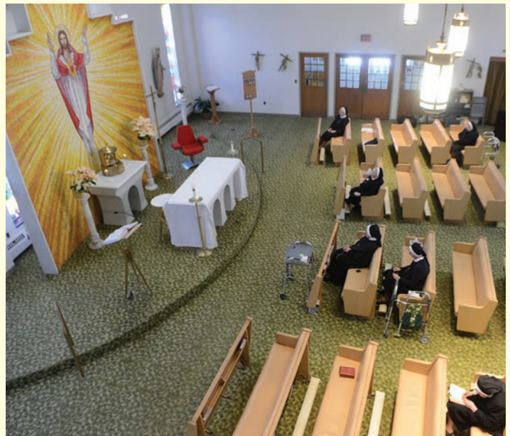
Sacred Heart Manor Chapel