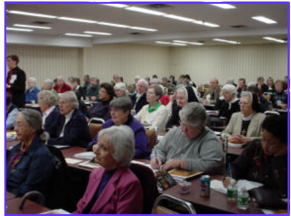
Participants at the workshop

Throughout the conference, members of religious institutes who had successfully addressed their property planning challenges provided practical examples of how to navigate various fiscal and facility issues. They also