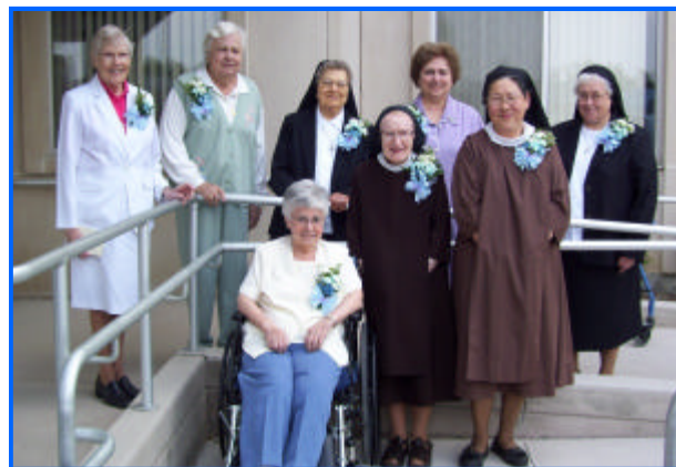
Three Dominican Sisters, two Carmelite nuns, and three Sisters of Sts. Cyril and Methodius celebrate a total of 440 years of consecrated religious life at Maria Hall's combined Jubilee celebration.

a grand reception was held for all. Together they celebrated—separate in mission and charism but one in faith. It was, after all, a leap of faith that brought them together.