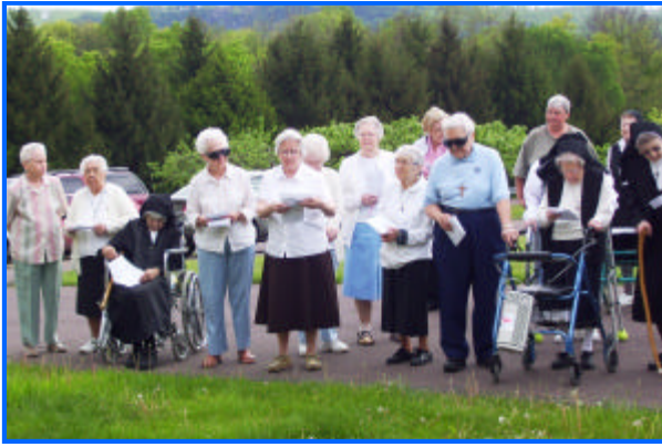
Dominican Sisters, Carmelite nuns, and Sisters of Saints Cyril and Methodius gather in May to crown the statue of Mary that greets all those who come to Maria Hall.