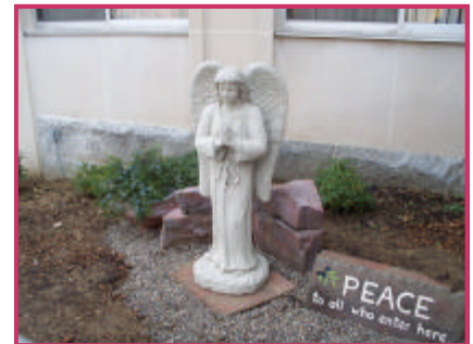
Peace Angel greets all who enter

Though from different traditions and apostolates, all three communities faced the similar problem of having facilities too large to meet their current needs. The exorbitant costs of maintaining these buildings coupled with the necessity of providing space better suited for their elder members prompted these communities to consider how their properties fit into their long-range plans. The congregations undertook intensive, multi-year analysis of their goals and priorities and, in so doing, found a common solution to their retirement and facility challenges.