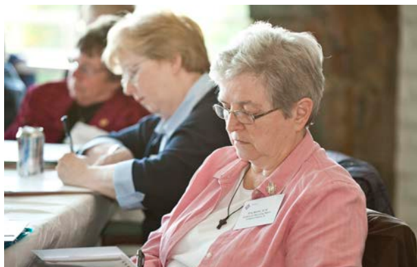
Participants attend an NRRO planning workshop.

effectiveness in terms of bolstering retirement savings and enhancing elder-care delivery. It will also enable the NRRO to compile the best practices of communities that have used Planning and Implementation Assistance to decrease their retirement-fund liabilities.