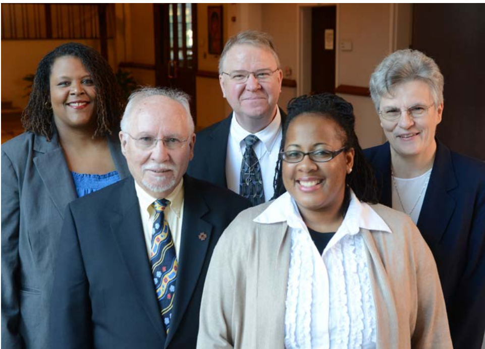
The NRRO Staff

A portion of the grant will be directed toward a comprehensive review of the NRRO's Planning and Implementation Assistance program. Launched in 2009, Planning and Implementation Assistance is a cohesive process for providing financial and consultative support to religious communities that are 40 percent or more underfunded for retirement. The goal is to help these communities reduce their retirement-funding shortfalls and thus increase their long-term ability to care for senior members. The evaluation will help the NRRO assess the program's