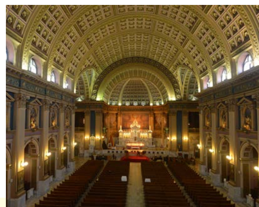
Our Lady of Sorrows Basilica