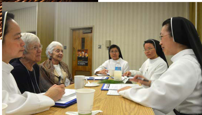
Participants in an NRRO planning workshop.

Direct Care Assistance provides supplemental support to help religious institutes provide for retirement needs while sustaining mission and ministry.