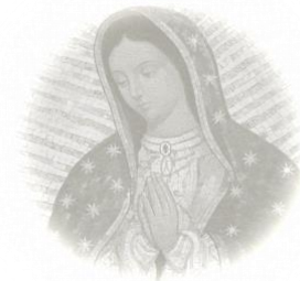
NABRE © 2010 CCD. Used with permission. Image: A mosaic of Our Lady of Guadalupe decorates a side altar in the Church of Santa Maria della Famiglia at the Vatican. Dec. 15.