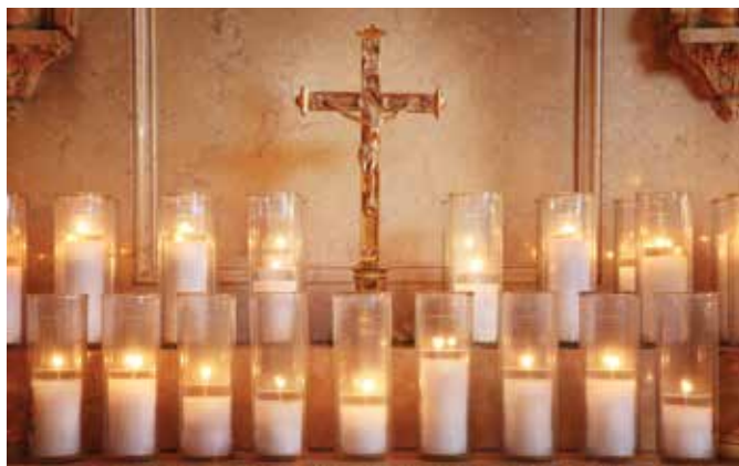
Scriptural excerpt from Lectionary for Mass for Use in the Dioceses of the United States, second typical edition , copyright © 2001, 1998, 1997, 1986, 1970, Confraternity of Christian Doctrine. Used with permission. All rights reserved. Excerpt from Catechism of the Catholic Church . 2nd ed. Washington, DC: United States Catholic Conference, 2000. Used with permission. All rights reserved. Copyright © 2019, USCCB, Washington, D.C. All rights reserved.

We are all sinners. But with the grace of God, we can be holy. We can be lights to the nations, sharing the truth about the irrevocable dignity of the human person. Where sin abounds, God’s grace abounds all the more. Therefore, let us take courage and offer prayer and penance, that all human life would be welcomed in love and protected in law. In all trials, tragedies, and sufferings, Christ is our hope .