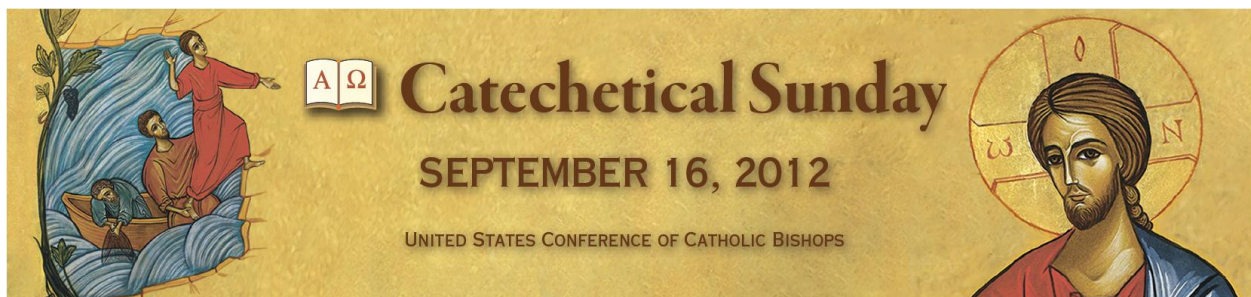
2012 Catechetical Sunday Banner