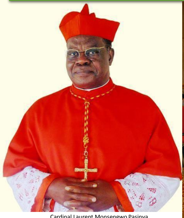
Cardinal Laurent Monsengwo Pasinya Archbishop of Kinshasa, Prefect Cardinal of the Congregation for the Evangelization of Peoples