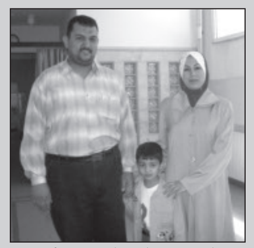
Iraqi refugee couple with son at Italian Hospital in Amman, run by Camboni Sisters, where boy was successfully treated