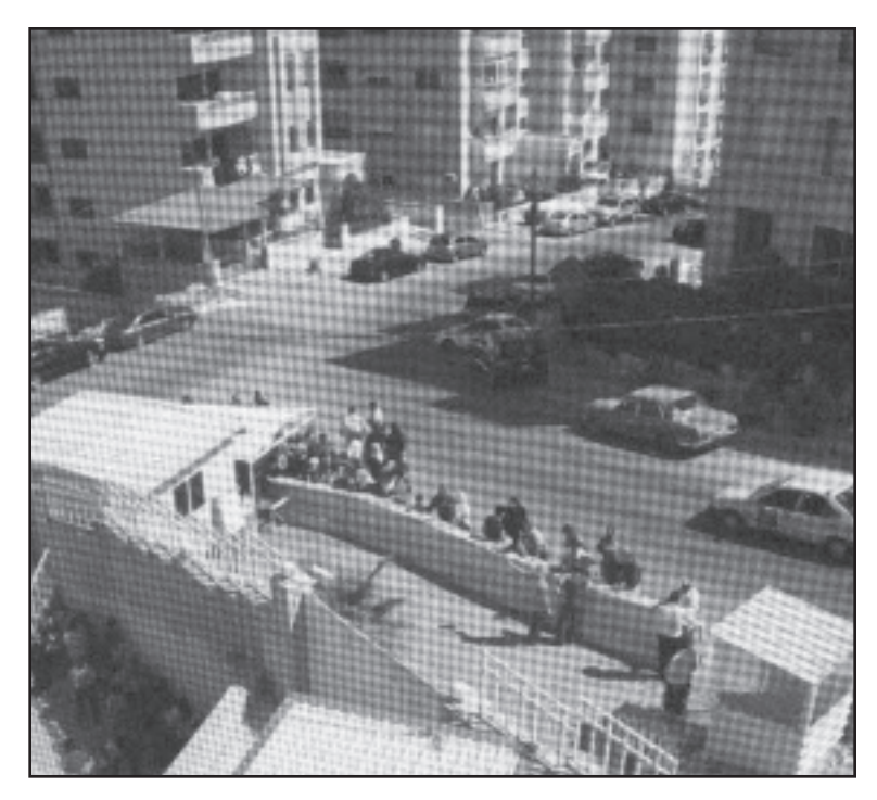
Entrance to UNHCR Amman, expanded from 30 staff to 120 to handle Iraqi refugee influx

Nonetheless, the numbers in the resettlement stream are so far disappointingly small compared to the need. UNHCR met a U.S. request for 7,000 referrals across the region before a July deadline, and traveling teams of Department of Homeland Security (DHS) officers have begun to interview them for resettlement acceptance in the United States, though the pace is extremely slow. New security demands are causing DHS interviewers to see only four cases per day instead of the normal six. UNHCR continues to refer refugees, and U.S. Assistant Secretary of State, Ellen Sauerbrey, said April 17, 2007 in Geneva that the U.S. could accept many more this year if UNHCR made the referrals. In August, the State Department estimated that it was on track to interview as many as 6,000 refugees by the end of September. As of the end of July, 190 refugees had arrived in the U.S., while, as of the end of August, 2,170 refugees in the region had been approved for U.S. resettlement but had not yet departed.