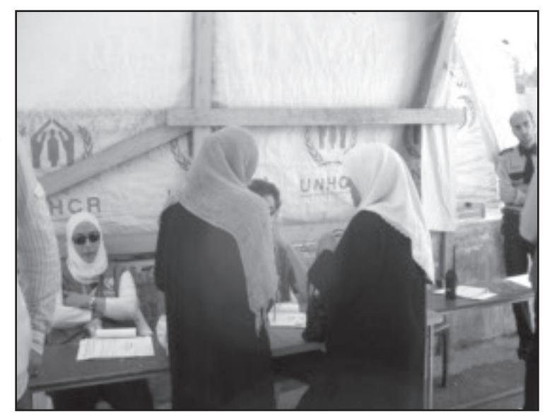
Iraqi women registering as refugees at just-built UNHCR facility seven miles outside Damascus

Education was a particular concern during the delegation's visit since the government had recently announced that only residents would be allowed to attend public schools, and the same policy would