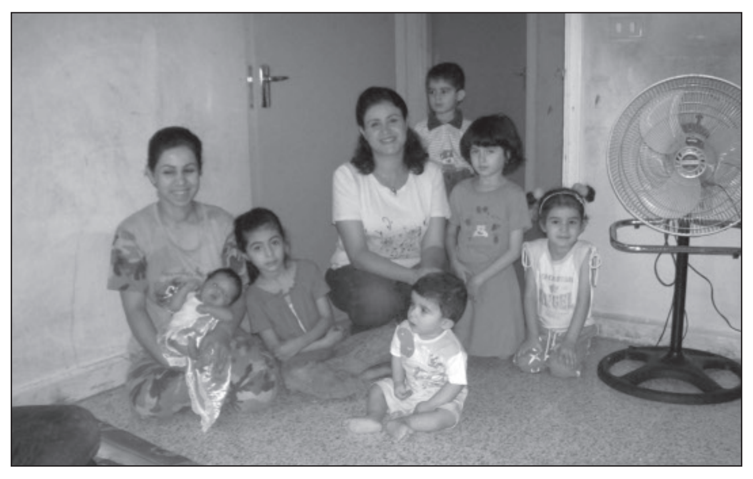
Two of three Sabean women and their children who share an apartment in Damascus. Their husbands had all left to seek a country of asylum.