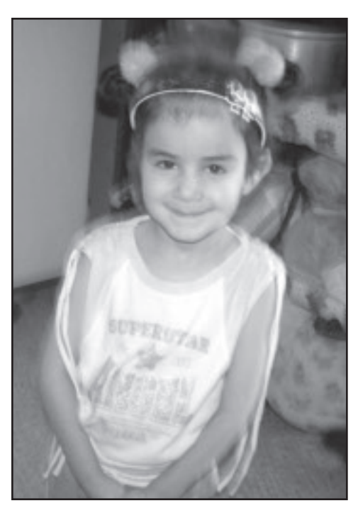
Refugee child who lives with mother and other refugee families in Damascus.

Along with the refugee influx into Syria has followed prostitution which is increasing according to UNHCR. The difficult living conditions are forcing a number of Iraqi refugee women and girls into prostitution as a last resort effort to provide for their families. There were also reports of traffickers bringing women from Iraq for sexual exploitation. The problem, well recognized among Syrians, is especially alarming in summer when Gulf State visitors arrive in large numbers reportedly seeking cheap, easily available prostitutes. The delegation was told Iraqi women were being sent to the Gulf States for the same reason. UNHCR is considering how to respond and told the delegation it would work mainly in the area of prevention.