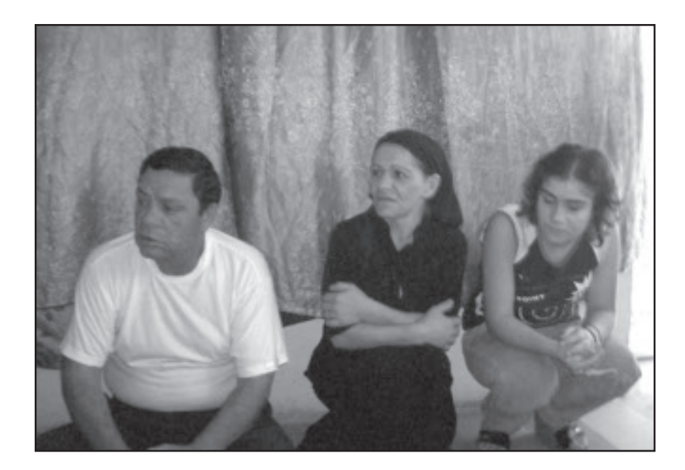
Refugee family in Damascus from Dora section of Baghdad. A son was killed in Baghdad and rest of family was threatened with death for being Christian. Daughter could not attend school in Damascus because she lacked Iraqi paper certifying her previous education.