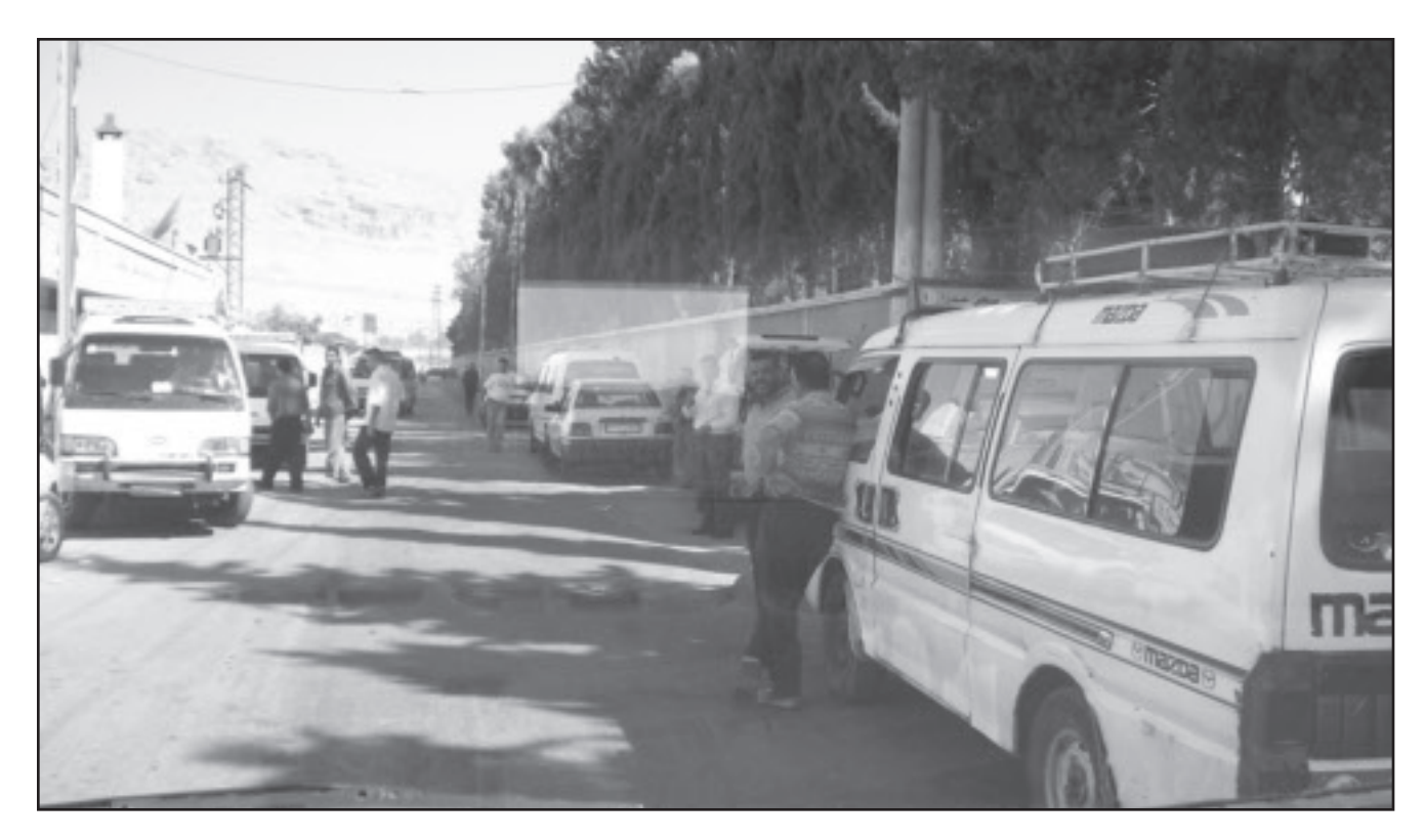
Taxis and minivans in front of UNHCR registration facility outside Damascus. Refugees need them because facility is far from city.