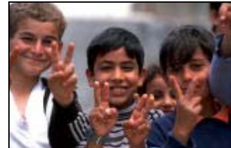
Children in the West Bank express their desire for peace.

The Holy Land is sacred to Jews, Christians and Muslims, but a tragic decades-old conflict has brought violence and suffering to its two peoples – Israelis and Palestinians – who yearn for a just peace. A durable peace agreement is essential for the future wellbeing of all the peoples of the Holy Land, including the Christian community, which is rapidly emigrating due to the difficult political and economic conditions imposed by the conflict.