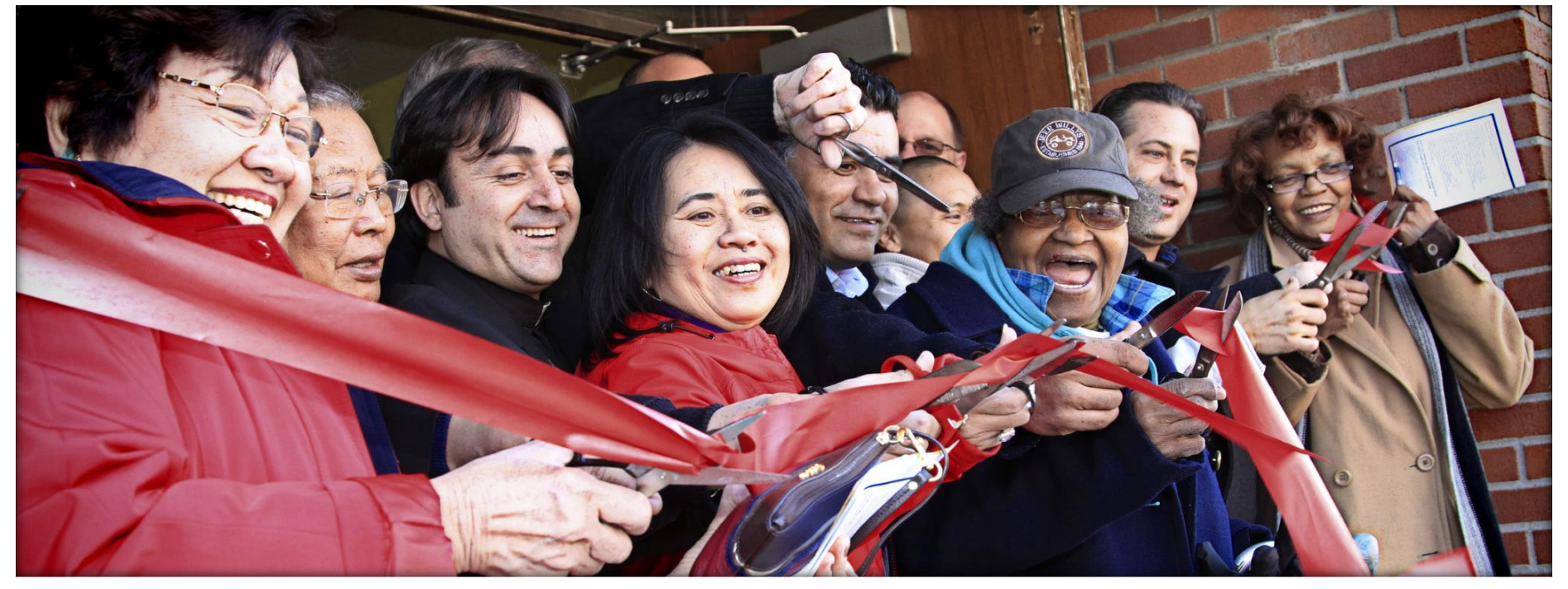
Community members celebrate the opening of The Aquinas Center in Philadelphia, PA