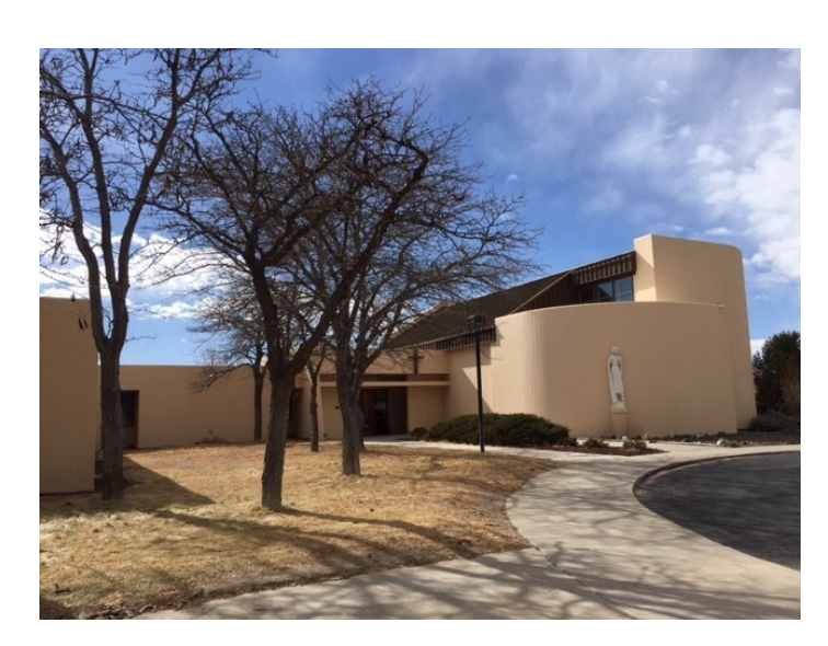
Assumption of the Blessed Virgin Mary Convent, Rio Rancho, NM, was one of the convents closed by the Felician Sisters. It is now part of Catholic Charities in New Mexico. The rectory on the property is being used for social services.

The work of closure unfolded with what felt like compassion. Each sister was interviewed individually so that personal needs could continue to be met and she could make an informed decision about where she preferred to relocate. While sisters residing in Pennsylvania had options as close as 90 minutes to 3.5 hours away, all options for the sisters of the southwest necessitated relocating to a new area of the country. Ultimately, they chose to do this together. Still, there are sisters of Our Lady of Hope Province who would likely describe these particular days of right-sizing, experienced as profound loss, as more difficult to bear than even the COVID-19 pandemic.