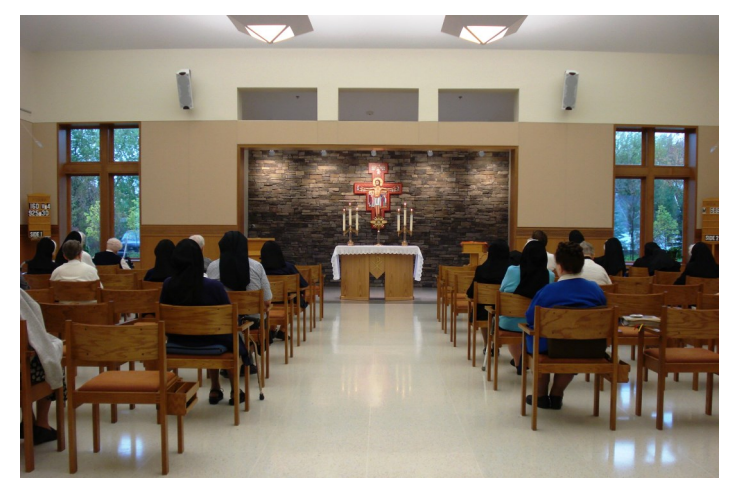
Franciscan Sisters of St. Joseph gather in prayer in the main chapel of Immaculate Conception Convent, Hamburg, NY. The new motherhouse is a platinum certified LEED building.

but a reminder that it is the spiritual that is at the heart of our calling. It is a reaching deeply into the inner vision that gives direction to our life and is a means of bringing God to the here and now. The fruit of our old age has the possibility to yield an abundance.