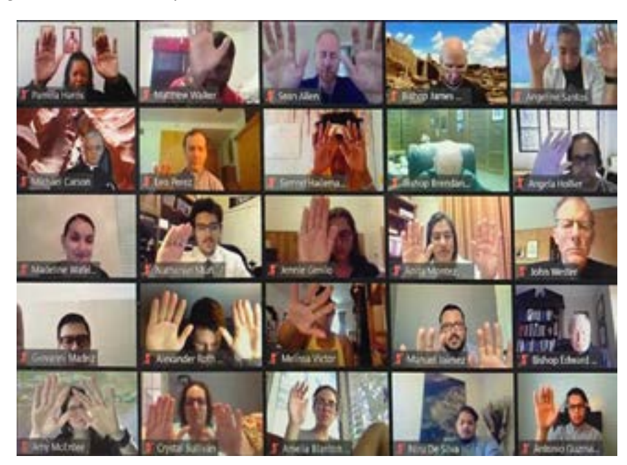
Journey Together Kick-off Event, 7.25.20

Through our Intra-cultural Conversations, we learn to intentionally dialogue with and challenge one another, so that we can have mutually engaging and empowering dialogue in our Inter-cultural Conversations. I must learn to balance between uniting in shared experiences (of culture, faith, or beliefs) and appreciating the distinctions of each person's life and experience. Holding the shared and the unique in tension is like living with the mystery of the Trinity: to know and love the one God and to seek relationship with each Person. In the paradox of the Trinity, the more I come to understand the uniqueness of each Person, the more I feel the unity that exists within. I pray that through our Church's experience of Journeying Together we may find the same mystery of unity in our great diversity as the Body of Christ.