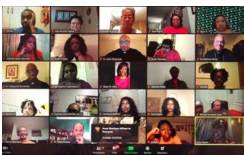
Screen Shot from African American Young Adult Listening Session 8.6.20

Some of the young adults voiced that this was the first time they actually felt heard and were part of majority rather than a minority, either by culture or age, in a Church setting. The overall understanding is that we have work to do. This Journeying Together process is creating opportunities to continue to engage in these tough conversations to gain hope from folks who have a tough faith. #blackfaithmatters