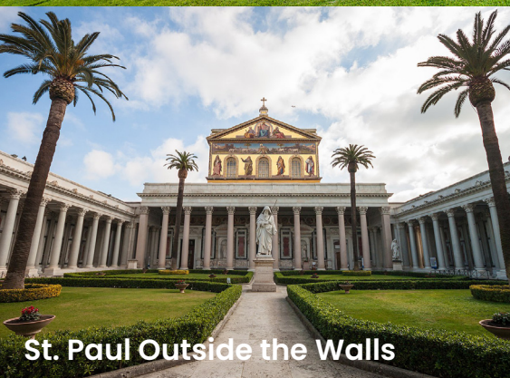
St. Paul Outside the Walls