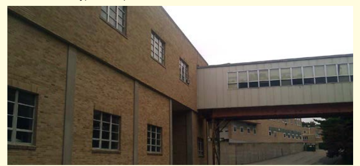
Daughters of St. Paul, Boston, Massachusetts