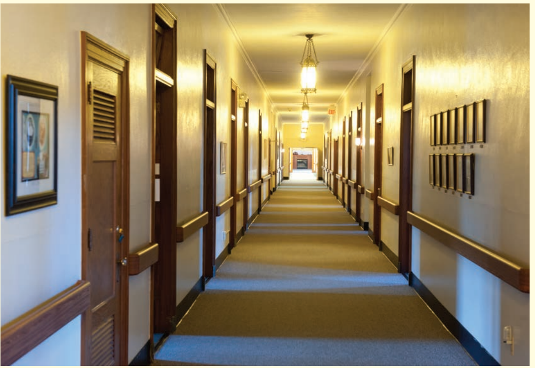
Sisters of St. Joseph of Chambéry, West Hartford, Connecticut

These motherhouse photos, provided by participants of the Planning and Implementation Assistance program, highlight the common challenges religious communities face when it comes to property planning and divestment. Designed for another era, these extremely large, single-use properties are expensive to maintain, hard to sell, and often even harder to renovate. Long, narrow hallways, steep stairwells, and poor lighting pose numerous obstacles for handicap accessibility, while bedrooms and bathrooms are ill-equipped for senior members.