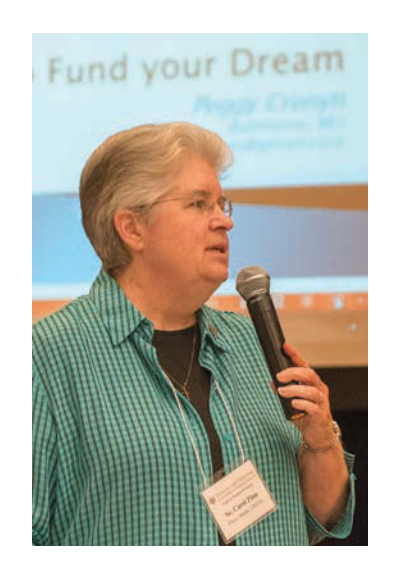
In 2016, the NRRO hosted 11 workshops on various topics.

The TTV workshop was a jam-packed, two-day program that furnished information, training, and resources on complex property issues. It was designed for religious communities currently involved in property planning and those for whom property-related decisions are imminent. Speakers addressed topics including green building, legal concerns, renovation vs. new construction, and how effective planning can help