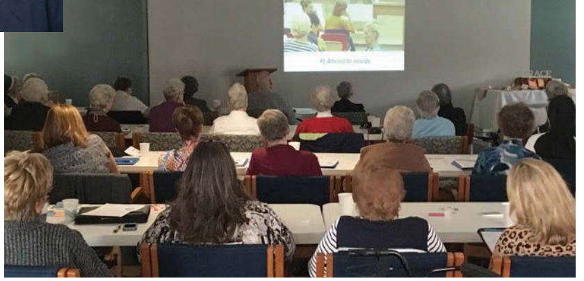
Above: Participants at the Moments of Grace workshop learn how to better support members with memory-loss.