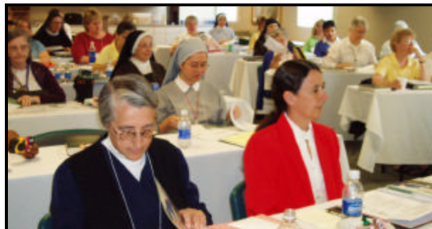
Participants at a workshop