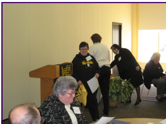
Participants at the San Antonio Workshop

Several religious institutes responded to the NRRO's initial invitation to participate in the pilot process. Based on their level of need, five religious institutes were selected for the first workshop.