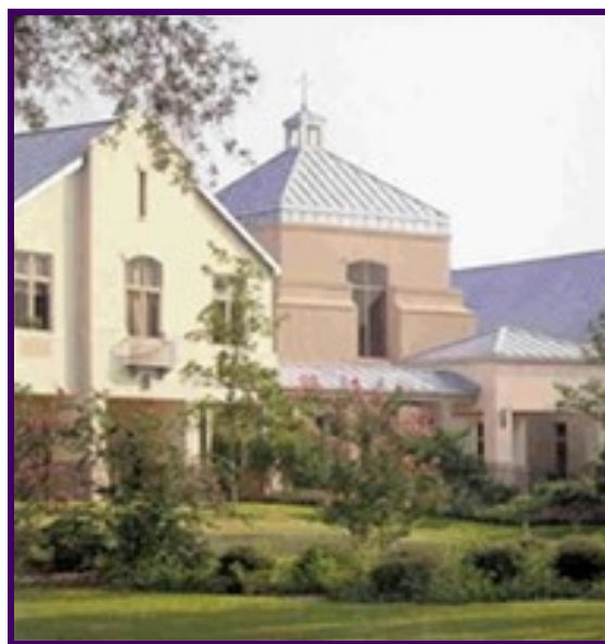
Oblate Renewal Center in San Antonio

In preparation for the workshop, each group previewed "A Future Full of Hope—Planning in Religious Institutes." Created by the NRRO in 2008, A Future Full of Hope is a DVD and guide offering case studies of religious institutes that have successfully addressed planning in areas such as property utilization, elder care, and new membership.