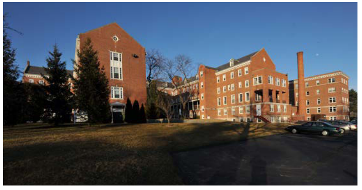
Participation in Planning and Implementation Assistance helped the Sisters of St. Joseph of Chambéry in West Hartford, Connecticut, to develop a plan to sell their expansive motherhouse ( above ), which no longer suited their needs and was expensive to maintain.

Underutilization of space and property management continue to be profound hurdles to adequately funding retirement. Equally challenging is finding costeffective ways to provide care, particularly skilled care. Increasingly, religious institutes must accept that care for senior members cannot always be furnished within the convent or monastery. That can be a harsh reality. On a brighter note, we have found that when religious institutes remain open-minded regarding alternative care options, they often are able to both lower costs and enhance quality of life for senior members.