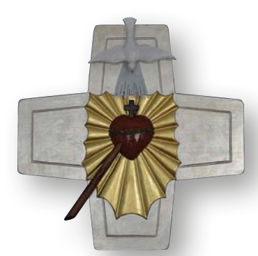
Cross of the Missionaries Guadalupanas

Right: Participation in Planning and Implementation Assistance enabled the Missionaries Guadalupanas of the Holy Spirit to transform their outdated provincial headquarters into a space where sisters young and old can live, pray, and minister in community.