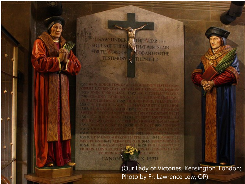
(Our Lady of Victories, Kensington, London;)

"I die the king's good servant, but God's first."