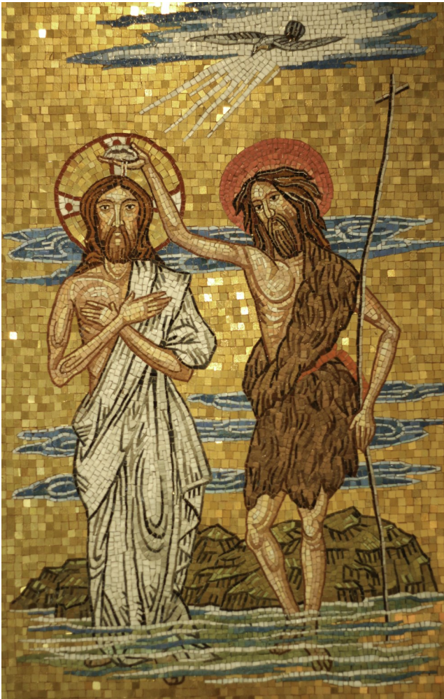
(National Shrine of the Immaculate Conception, Washington, DC;)