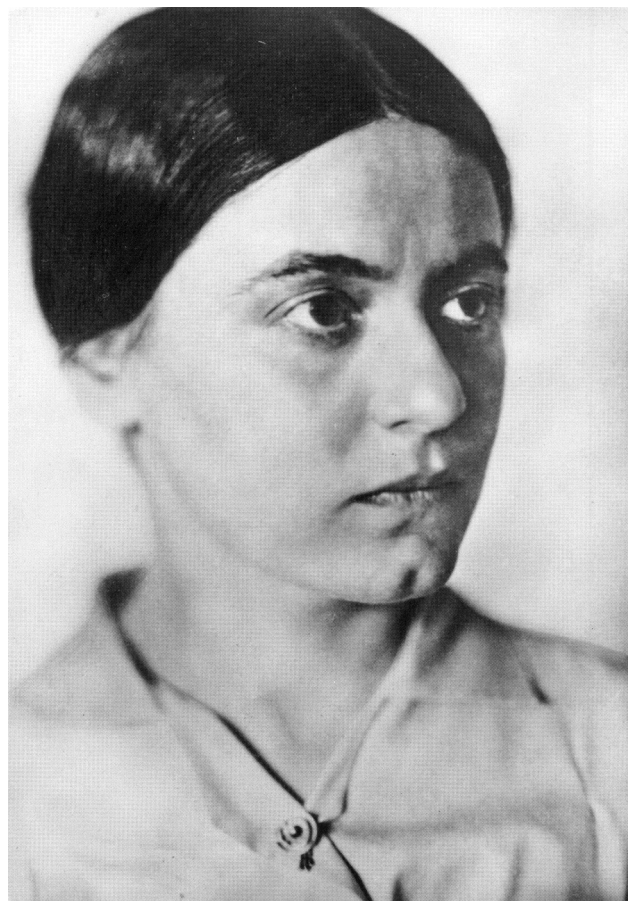
Edith Stein at age 40 (1931)

During the rise of Nazism, Stein spoke up. She wrote to Pope Pius XI asking the Church to speak up on behalf of persecuted Jews, and she wrote her autobiography, Life in a Jewish Family , "as a way to combat racial hatred." The Nazis captured Sister Teresa Benedicta of the Cross in 1942 and took her to Auschwitz, where she died in the gas chamber shortly after arrival.