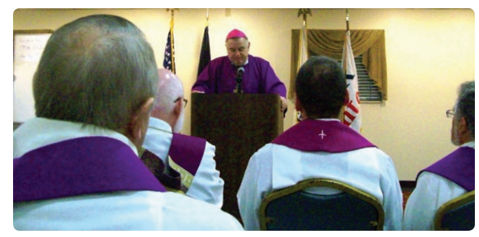
Closing Mass with Archbishop Wenski of Miami, concelebrating priests, and conference participants