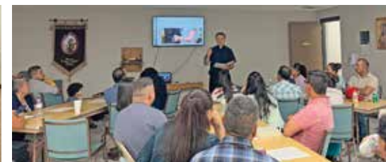
The Diocese of Dodge City organizes “Marriage as Sacrament” and “Engaged Encounter” weekend retreats and workshops for couples seeking to build lasting, loving marriages. With support it receives from Catholic Home Missions, the diocesan Office of Hispanic Ministry has been able to make Spanish-language sessions of this program more widely available to the region’s growing Latino population.