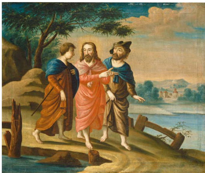
Christ on the Road to Emmaus c. 1725/1730 Gift of Edgar William and Bernice Chrysler Garbisch