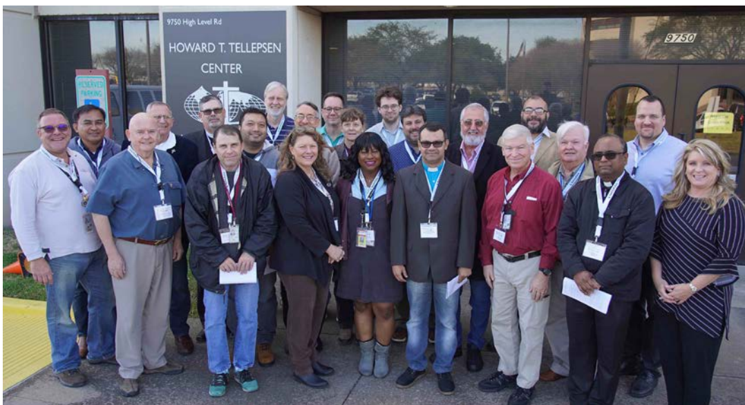
Students at the Houston School