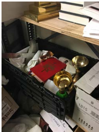
Mass supplies which were in the storage area.. We had all the necessary supplies..

Gary J. Vrazel Apostleship of the Sea - Mobile PO Box 1588 Mobile, AL 36633