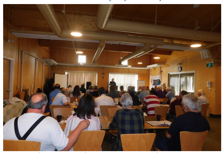
Delegates met to hear presentations and participate in discussions of issues for those involved in the maritime ministries.