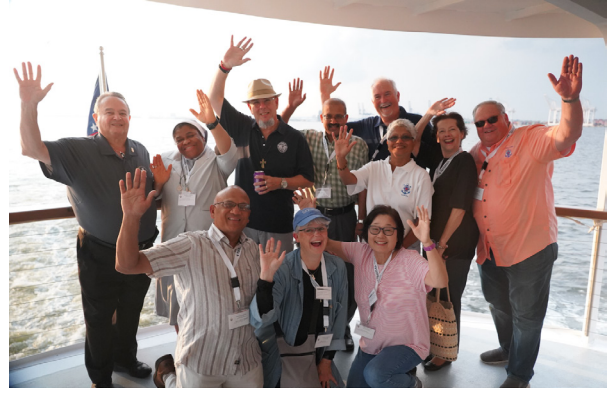
Above: NAMMA Conference Particpants Below: AOS Chaplains and Port Volunteers at the NAMMA Conference