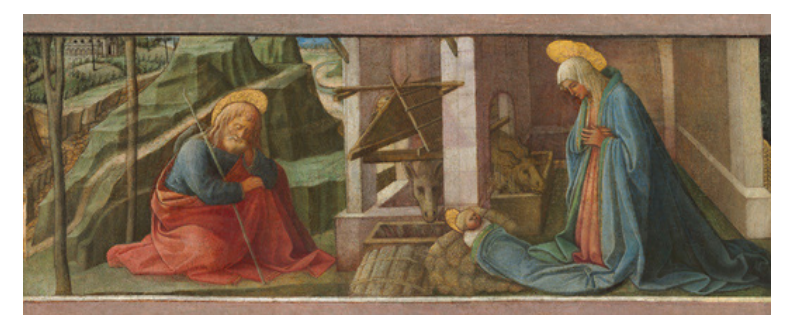
The Nativity, Fra Filippo Lippi, Courtesy of the National Museum of Art

Expectations! Even our priests on board have expectations of their ministry. And as they grow in the ministry, their expectations of that ministry continues to grow.