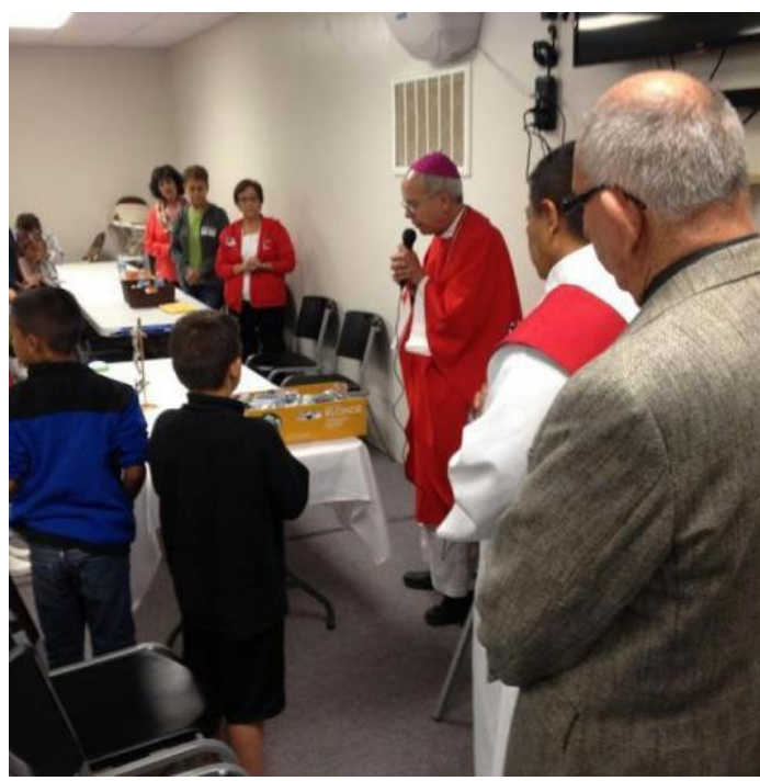
Bishop Mark Seitz of El Paso, Texas celebrates Mass with immigrant family detainees in Artesia, New Mexico.