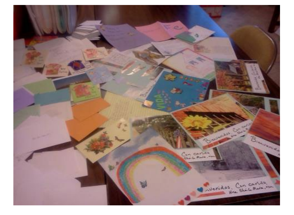
Letters and cards of support sent by Catholic families and women religious to detained immigrant children.

Recently, the U.S. government's use of family detention as a deterrent has been called into question