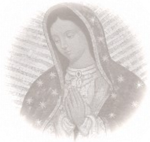
Excerpts from Evangelium vitae © 1995, Libreria Editrice Vaticana. Used with permission. All rights reserved. Image: A mosaic of Our Lady of Guadalupe decorates a side altar in the Church of Santa Maria della Famiglia at the Vatican. Dec. 15.

October is Respect Life Month, and this year's theme is "Live the Gospel of Life." Dive deeper into what it means for our daily lives at respectlife.org/celebrate .