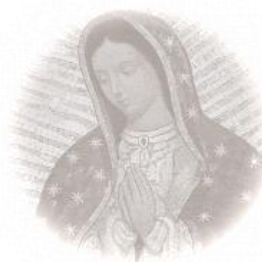
Image: A mosaic of Our Lady of Guadalupe decorates a side altar in the Church of Santa Maria della Famiglia at the Vatican. Dec. 15.

The Immaculate Conception ( www.bit.ly/immaculate-conception-2020 ) celebrates the conception of Mary in the womb of St. Anne without the stain of original sin. This solemnity is sometimes confused with the Annunciation, in which the Church celebrates the conception of Jesus in the womb of the Blessed Mother. While it's important to understand this distinction, both celebrations highlight the beauty and goodness of God's gift of new life.