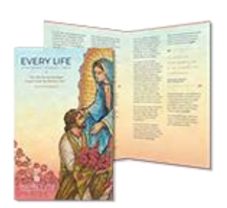
Order | Download

USCCB Secretariat of Pro-Life Activities Respect Life Reflection: Cherished, Chosen, Sent usccb.org/cherished-chosen-sent-reflection