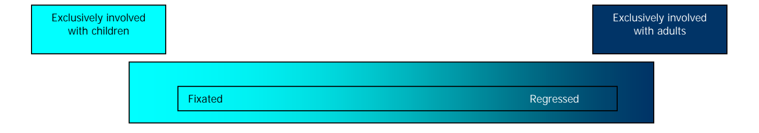
Table 2. Characteristics of fixated and regressed offenders.