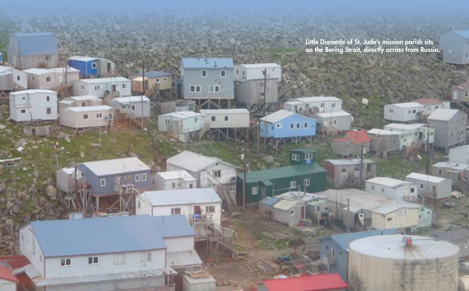
Little Diomedes of St. Jude's mission parish sits on the Bering Strait, directly across from Russia.

Planes are integral to bush travel, but fuel costs are a limiting factor. A five-seat plane that rented for $120/hour 12 years ago now costs $500/hour.